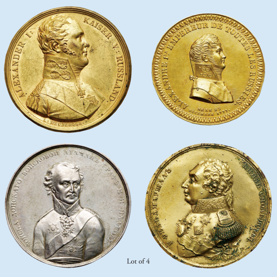
2117 Lot of 4 Napoleonic and post-Napoleonic War Obverse Cliches Alexander I (2), Field Marshal Kutuzov and Ataman Platov. Three gilded. (Lot of 4). Extremely fine.