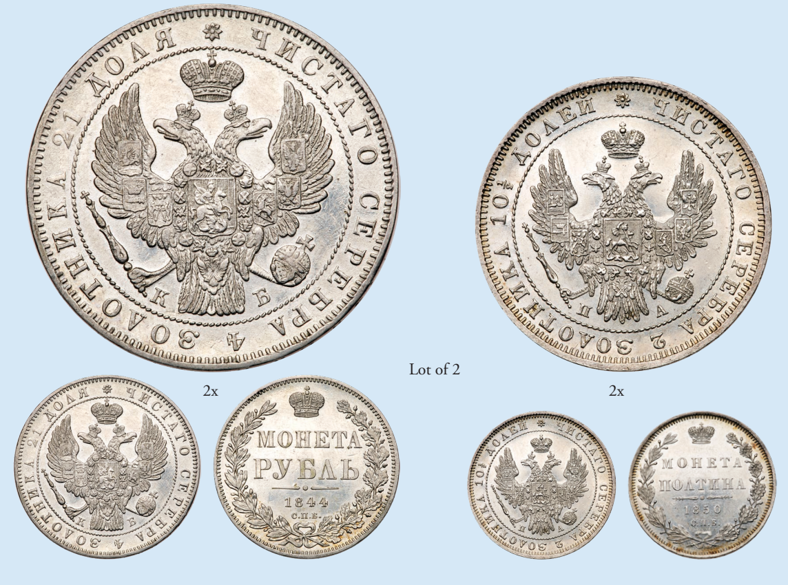
2134Lot of two: Rouble, 1844 СПБ-КБ. Bit 205. Cleaned. About uncirculated; and Poltina<br/>1850 СПБ-ПА. Bit 263. Good lustre.Uncirculated. (Lot of 2).