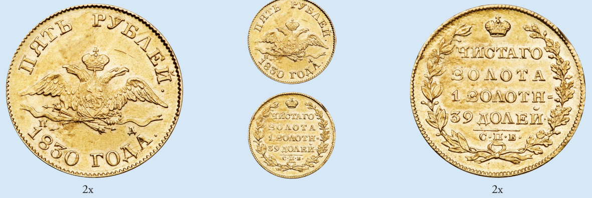
21205 Roubles 1830 СПБ- ПД. GOLD. Bit 5, Fr 154. Small rim tap and some obverse contact<br/>marks.Extremely fine.