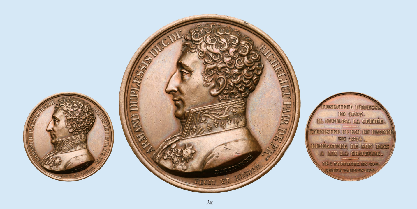
2118 Homage to Armand du Plessis, Governor of Odessa, on his death 1822 Medal. Bronze. 41.5 mm. By Dieudonné. Uniformed bust of du Plessis left / Nine-line legend with vital dates. About uncirculated.