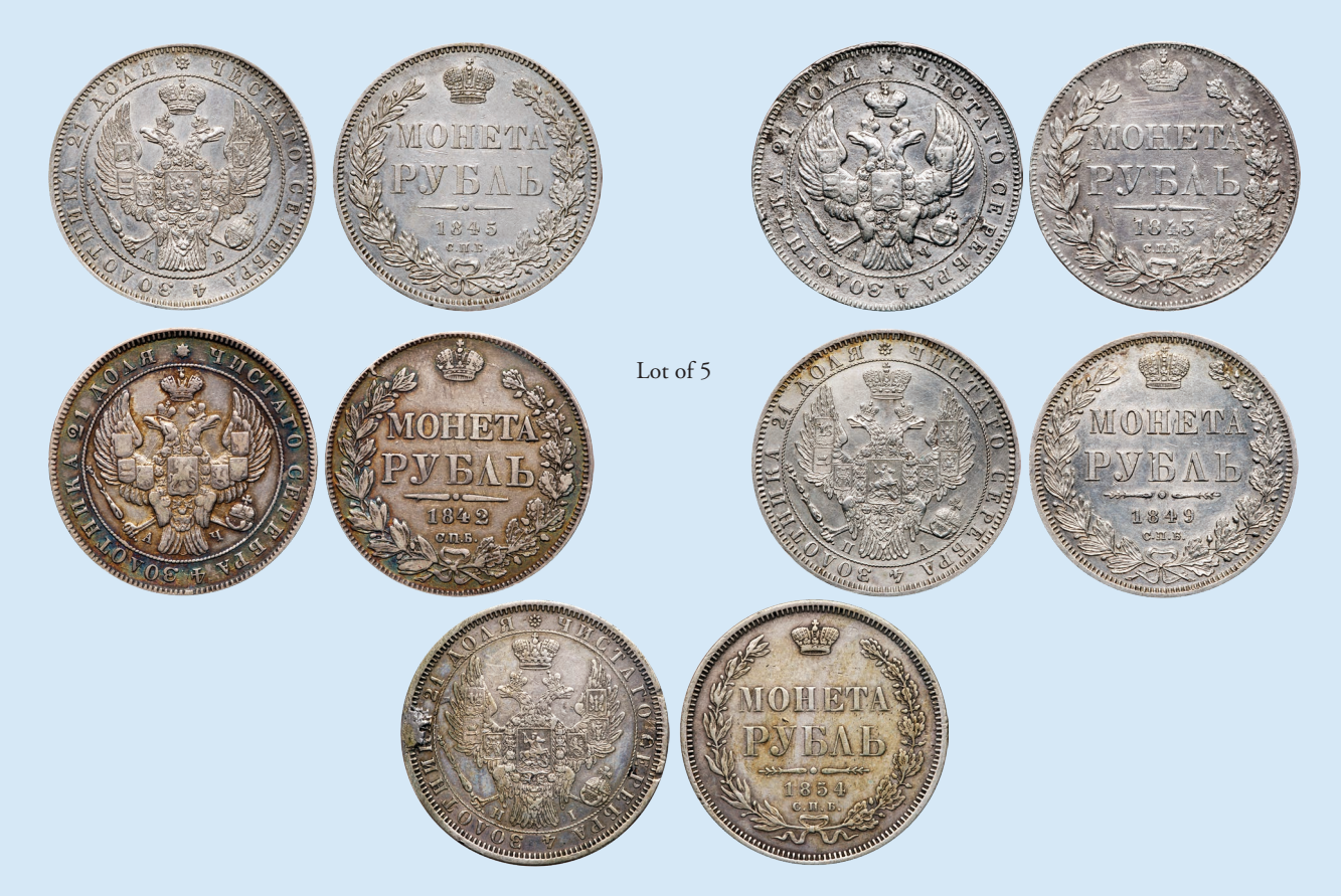
2133 Lot of five Roubles: 1842, 1843 CΠ5 AЧ, 1845 K5,1849 ΠA, 1854 HI. Bit 201, 203, 207,<br/>224, 233. One ex jewelery.About Very Fine-Extremely Fine. (Lot of 5)